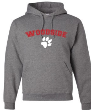
Adult Hoodie (35) Youth Hoodie (25)

Elementary and Middle School Print Available