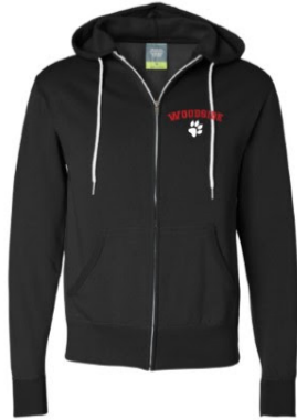
Adult Zipper Hoodie (40) Youth Zipper Hoodie (45)