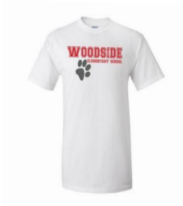
Adult T-Shirt (20) Youth T-Shirt (15)